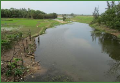
Left & Above Left: North of the Cua Viet River where Rusty Cascio's MedEvac picked up 8 WIAs

13 Aug Thur - (Day 13) After breakfast we visit the Ho Chi Minh Mausoleum, the home of Ho Chi Minh, the Three-Tiered Pagoda and if time permits the army museum and the ethnicity museum. We return to the hotel to prepare for late evening flights that day. Anyone with a rare early morning flight, they will depart on the 15 th . (B/L)