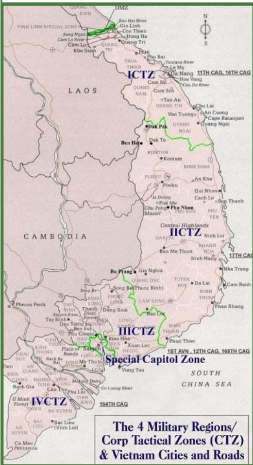
The 4 Military Regions/ Corp Tactical Zones (CTZ) & Vietnam Cities and Roads